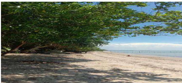
Figure 2. The Beauty of Berawe Beach

"... this tour began to open in 2004, precisely in December, coinciding with the tsunami disaster in Aceh. At that time, people clearing land and cleaning the beach were surprised by the unusual phenomenon of seawater. The seawater suddenly experienced tides but did not emit large waves until at night, when we found out that there had been a large tsunami in Aceh." (Interview with Amir Husein, September, 2023)