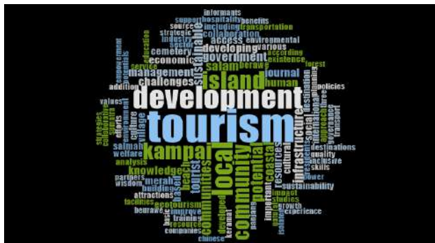
Figure 6. Word Cloud of Kampai Island Tourism

“One of the biggest challenges in developing Kampai Island is human resources. We are very aware of the limited human resource capacity here. If the government also neglects this condition, how can we possibly rise? As a teacher, I observed that there are intellectually intelligent children here. However, they are forced to drop out of school due to financial constraints”. (Interview with Nazian, August, 2023)