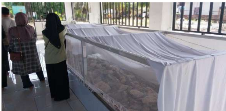
Figure 3. Keramat Panjang Cemetery

These narratives contribute to the local belief that the tomb is sacred and spiritually potent. Consequently, it has become a pilgrimage site where people perform vows and prayers, trusting in the tomb's perceived efficacy. Empirical evidence shows this site has been a multicultural pilgrimage destination. From the 1990s until 2011, the tomb also served as a site of worship for the Chinese community on Kampai Island, who regarded it as linked to a deity. Chinese residents and visitors from neighboring cities and countries such as Singapore and Malaysia would visit daily, demonstrating a spiritual appeal that transcends a single religious group.