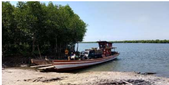
Figure 5. Getek, the Transport Mode Connecting Kampai Island with Sarangjaya Village

“...existing infrastructure is very limited, not only the transportation connecting Kampai Island to the mainland, but also the problematic village road infrastructure. This condition affects the transport of agricultural products to the mainland and access in emergencies, such as illness” (Interview with Mahyar, August, 2023).