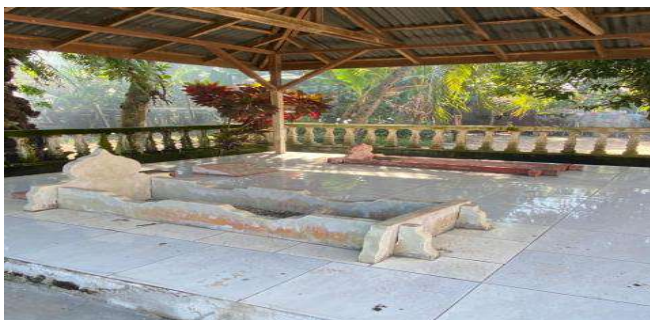
Figure 4. Mas Merah Cemetery

The site's potential is rooted in this well-documented cultural-historical narrative of the love story between Salam and Salmah (Mas Merah), which has been passed down orally. This story links Kampai Island to Peninsular Malaysia and Medan, offering opportunities for narrative tourism development. Physical evidence indicates academic institutional interest, as the tomb was renovated on the initiative of the Faculty of Law at North Sumatra Islamic University (UINSU) in 1991. However, its location, surrounded by residential houses without clear boundaries, indicates a lack of structured destination management.